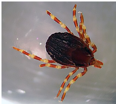
Figure 3. Morphological features of ixodid mites of the genus Hyalomma identified in farm animals