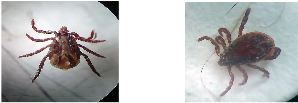
Figure 2. Dorsal and abdominal mite species of the genus Rhipicephalus