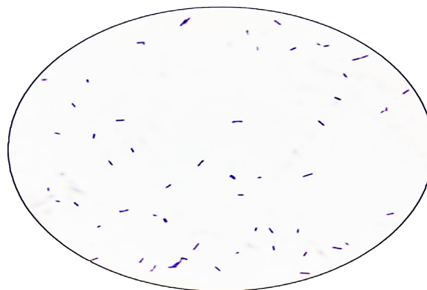
Figure 5. Microscopic image of the causative agent of brucellosis, stained according to Gram

Microscopic examination of stained preparations prepared from pathological material revealed characteristic morphological features of the pathogen. Figure 5 shows Gram-positive rod-shaped bacteria, located mainly singly or in pairs, with clear contours and a