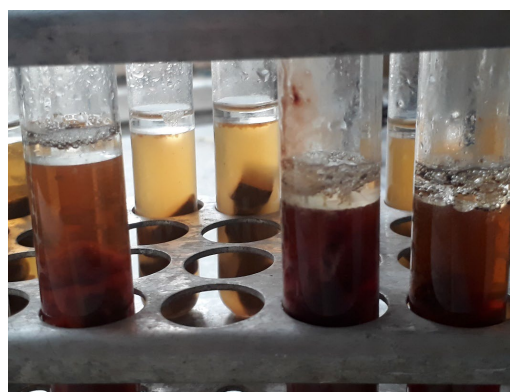
Figure 4. Growth of the causative agent of blight with clouding of the culture medium and formation of air bubbles under petroleum jelly oil

bubbles under a layer of petroleum jelly oil, indicating active metabolic activity of the pathogen. The change in the colour of the medium from light yellow to dark brown may be due to the formation of metabolites and protein breakdown products accompanying the vital activity of clostridia and confirms the reproduction of the pathogen and its interaction with the components of the culture medium. However, the colour of the medium is not a specific diagnostic feature. Thus, the results of bacteriological culture confirm the presence of Clostridium septicum in the test material and indicate a typical course of blackleg in sheep, accompanied by massive intoxication, gas formation and high mortality. A microscopic image of Gram-positive bacteria of the causative agent of brucellosis is shown in Figure 5.