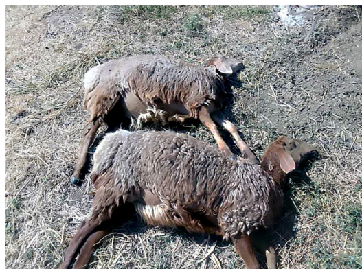
Figure 1. Sheep dead from brucellosis

The study was conducted in 12 sheep farms located in the Kashkadarya, Samarkand and Jizzakh regions of the Republic of Uzbekistan. The total number of sheep in the surveyed farms was about 8,000, which corresponds to the number of sheep in focal flocks with an increased incidence of brucellosis. At the same time, the total number of sheep in the three regions is about 50-70 thousand. For bacteriological studies, pathological material (75 samples) was collected from dead animals (Fig. 1): pieces of liver, heart, kidneys, tubular bones and muscle tissue from the affected areas (Fig. 2). Samples were collected in accordance with the rules of asepsis and antisepsis.