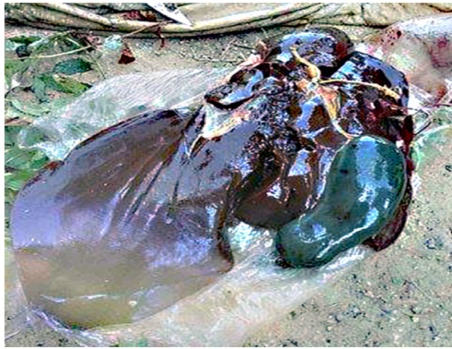
Figure 2. Damaged internal organs